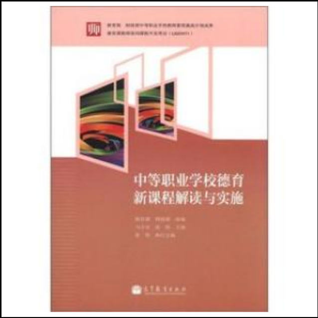
Filesize: 3 MB

This is actually the greatest pdf i actually have read until now. it absolutely was writtern really properly and beneficial. Your life period will be change when you complete looking over this pdf. (Lurline Little)